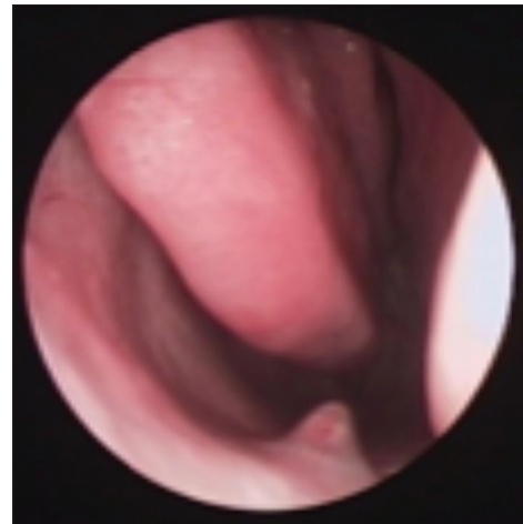
Figure 1: A clinical photograph showing an implant that is potentially protruding into the nasal cavity using sinuscopy

In the past few years, several authors have recommended the use of Corticobasal ® implants to achieve bicortical anchorage (e.g., crest of the ridge and maxillary sinus floor) and to ensure implant stability in patients with severe ridge resorption or compromised bone support. [26-36] Consequently, implants may have exposed to the nasal and maxillary sinuses [Figure 1] with possible challenging effects. Although many studies have reported that Corticobasal ® (BECES ® ) implants have very favorable outcomes with limited and manageable complications, [27-29,34-36] there is still some doubt concerning the effect of their penetration into the nasal and maxillary sinuses. In 2018, Lazarov [37] published a prospective cohort study in which patients treated with Strategic Implant ® technology who underwent placement of 375 BCS ® implants in 105 maxillary sinuses were followed for 3–4.5 years. The maxillary sinuses were assessed preoperatively on panoramic views and clinical examination. Patients with symptoms of